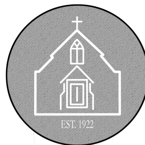
ST. THOMAS' EPISCOPAL CHURCH ISLE OF HOPE, GA