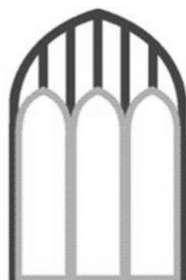
FIRST PRESBYTERIAN CHURCH A Servant Church in the City Since 1827