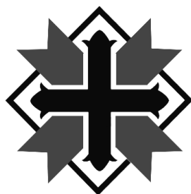
FIRST BAPTIST CHURCH SAVANNAH, GEORGIA - SINCE 1800